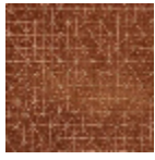
L3294_QUADR ILLE_C517_FG_ VERSO