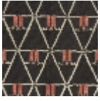
L3475_RANAV ALO_N3002_N 3114_FG