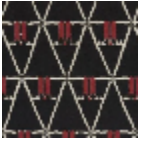
L3475_RANAV ALO_B54_B84 _FE