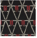
L3475_RANAV ALO_B54_B84 _FE