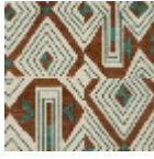
L3559_JAZZ_C 538_C512_C517 _FE