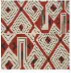
L3559_JAZZ_B 54_B68_B92_B 84_FE