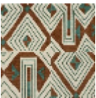
L3559_JAZZ_C 538_C512_C517 _FE