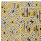
L3559_JAZZ_B 69_B32_N3010 _FE