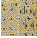
L3559_JAZZ_B 69_B32_N3010 _FE