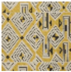
L3559_JAZZ_B 69_B32_N3010 _FE