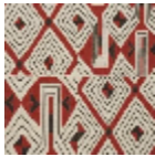
L3559_JAZZ_B 54_B68_B92_B 84_FE