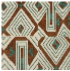
L3559_JAZZ_C 538_C512_C517 _FE