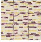
L3568_ATLANT IDE_N3010_N3 117_FE