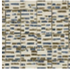
L3568_ATLANT IDE8C533_C54 2_FE