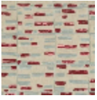
L3568_ATLANT IDE_B90_B30_ FE