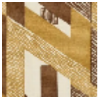
L3569_HYPER BOLE_C515_C5 12_FE