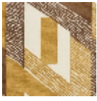
L3569_HYPER BOLE_C515_C5 12_C511_FE