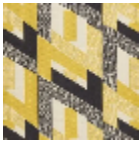
L3569_HYPER BOLE_N3002_ N3010_FE