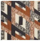
L3569_HYPER BOLE_N3013_ N3002_FE