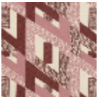
L3569_HYPER BOLE_B09_N3 024_FE