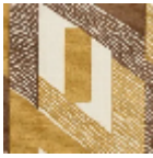
L3569_HYPER BOLE_C515_C5 12_C511_FE