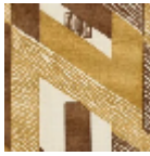
L3569_HYPER BOLE_C515_C5 12_FE