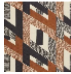
L3569_HYPER BOLE_N3013_ N3002_FE