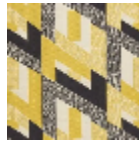
L3569_HYPER BOLE_N3002_ N3010_FE