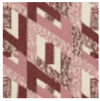
L3569_HYPER BOLE_B09_N3 024_FE