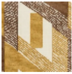
L3569_HYPER BOLE_C515_C5 12_C511_FE