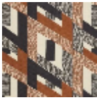
L3569_HYPER BOLE_N3013_ N3002_FE