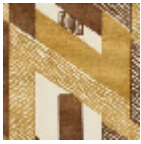
L3569_HYPER BOLE_C515_C5 12_FE