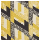
L3569_HYPER BOLE_N3002_ N3010_FE