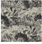
L3600_VERTIG E_B54_FE_Ver so