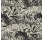
L3600_VERTIG E_B54_FE_Ver so