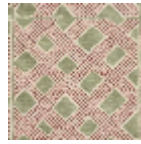
L3699_BEHAN ZIN_C544_B41 _FE