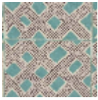
L3699_BEHAN ZIN_B73_B14_F E