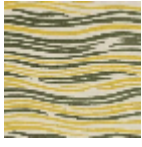
L3702_LES_ON DES_C541_N30 10_FE