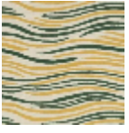
L3702_LES_ON DES_B22_B56_ FE