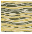
L3702_LES_ON DES_C541_N30 10_FE