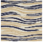
L3702_LES_ON DES_C531_C51 4_FE