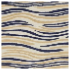
L3702_LES_ON DES_C531_C51 4_FE