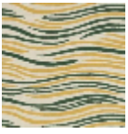
L3702_LES_ON DES_B22_B56_ FE