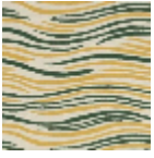
L3702_LES_ON DES_B22_B56_ FE