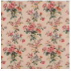
L3709001 Original 5734