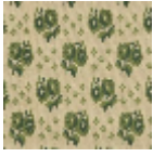
L3788_LOUISE TTE_B23_B22_ FI