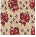
L3788_LOUISE TTE_B13_B02_ FI