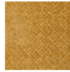
L3845_HOGGA R_C515_FI_VER SO