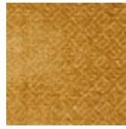
L3845_HOGGA R_C515_FB_VE RSO