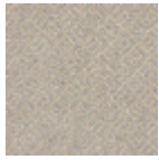
L3845_HOGGA R_B20_B06_F G_Verso