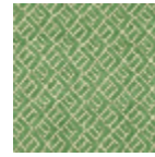
L3845_HOGGA R_N3018_FE_V ERSO