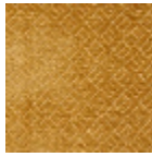
L3845_HOGGA R_C515_FB_VE RSO