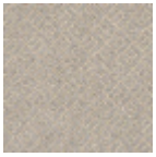
L3845_HOGGA R_B20_B06_F G_Verso