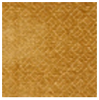
L3845_HOGGA R_C515_FB_VE RSO