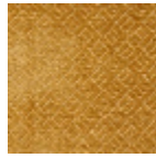
L3845_HOGGA R_C515_FB_VE RSO