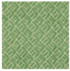
L3845_HOGGA R_N3018_FE_V ERSO