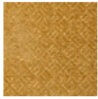
L3845_HOGGA R_C515_FI_VER SO