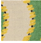
L3896_LA_RIV ERE_N3018_N3 010_B54_FE