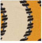
L3896_LA_RIV ERE_B58_B54_ B53_FE