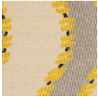
L3896_LA_RIV ERE_N3003_N 3010_B54_FE