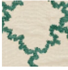
L3897_BRODE RIE_MONTESP AN_C538_FE