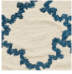
L3897_BRODE RIE_MONTESP AN_C533_FE