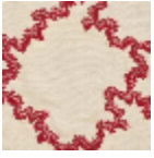
L3897_BRODE RIE_MONTESP AN_B90_FE