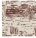
L3912_LABYRI NTHE_N3162_F E