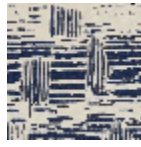
L3912_LABYRI NTHE_N3121_F E