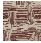
L3912_LABYRI NTHE_N3162_F G