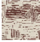
L3912_LABYRI NTHE_N3162_F E