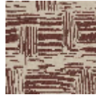
L3912_LABYRI NTHE_N3162_F G