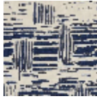
L3912_LABYRI NTHE_N3121_F E