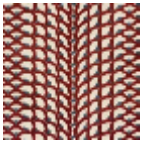
L3914_LES_EC AILLES_C526_ C534_FE