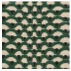
L3914_LES_EC AILLES_B22_B 54_FE