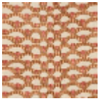
L3914_LES_EC AILLES_N3155_ N3104_FE