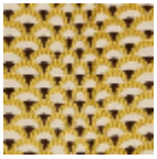
L3914_LES_EC AILLES_N3017_ C509_FE