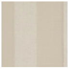
L3918_HASTIN G_Rayure_N31 83_FE_1