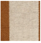
L3918_HASTIN G_Rayure_C512 _FE