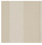
L3918_HASTIN G_Rayure_N31 83_FE_1