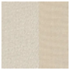
L3918_HASTIN G_Rayure_N31 83_FE