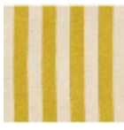
L3920_BRIGHT ON_Rayure_B7 6_FE