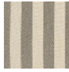
L3920_BRIGHT ON_Rayure_N3 003_FE