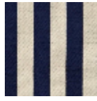
L3920_BRIGHT ON_Rayure_C5 31_FE