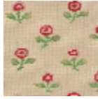
L3976_LES_PO MMES_Caneva s_N3014_N3018 _N3022_N3023 _FG