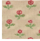
L3976_LES_PO MMES_Caneva s_N3014_N3018 _N3022_N3023 _FG