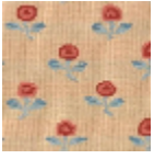
L3976_LES_PO MMES_Caneva s_B41_B45_B7 4_B39_FB