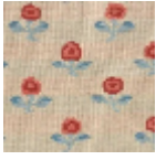
L3976_LES_PO MMES_Caneva s_B41_B45_B7 4_B39_FG