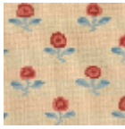
L3976_LES_PO MMES_Caneva s_B41_B45_B7 4_B39_FI