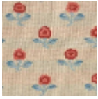
L3976_LES_PO MMES_Caneva s_B41_B45_B7 4_B39_FG