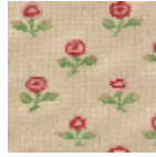
L3976_LES_PO MMES_Caneva s_N3014_N3018 _N3022_N3023 _FG