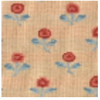
L3976_LES_PO MMES_Caneva s_B41_B45_B7 4_B39_FB