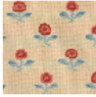
L3976_LES_PO MMES_Caneva s_B41_B45_B7 4_B39_FI