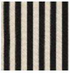
L4004_PLYMO UTH_Rayure_ B54_FE