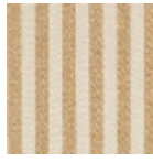
L4004_PLYMO UTH_Rayure_N 3184_FE