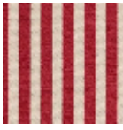
L4004_PLYMO UTH_Rayure_C 523_FE