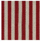
L4004_PLYMO UTH_Rayure_N 3025_FM