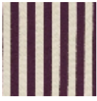
L4004_PLYMO UTH_Rayure_B 14_FE