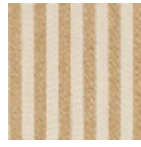
L4004_PLYMO UTH_Rayure_N 3184_FE