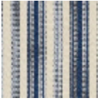
L4020_MALMA ISON_Rayure_ B38_B21_FE