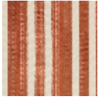
L4020_MALMA ISON_Rayure_ C517_FE