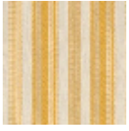
L4020_MALMA ISON_Rayure_ B56_FE