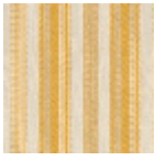
L4020_MALMA ISON_Rayure_ B56_FE