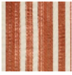
L4020_MALMA ISON_Rayure_ C517_FE