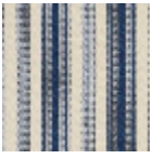
L4020_MALMA ISON_Rayure_ B38_B21_FE