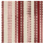
L4020_MALMA ISON_Rayure_ N3025_FE