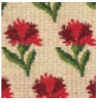
L4042_LES_OE ILLETS_Caneva s_B23_B22_B0 2_B13_FI