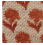
L4042_LES_OE ILLETS_Caneva s_C517_C517_C 517_C517_FM