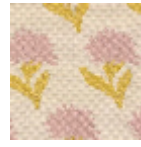
L4042_LES_OE ILLETS_Caneva s_N3017_N3017 _N3022_N3022 _FE