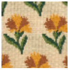
L4042_LES_OE ILLETS_Caneva s_B23_B22_B5 8_B57_FI