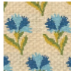
L4042_LES_OE ILLETS_Caneva s_B76_B23_B3 7_B21_FE