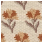
L4042_LES_OE ILLETS_Caneva s_B70_B94_B6 7_B57_FE