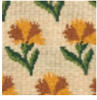
L4042_LES_OE ILLETS_Caneva s_B23_B22_B5 8_B57_FI