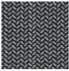
L4043_CERES_ B45_B54_VER SO