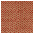
L4043_CERES_ C520_C513_VE RSO