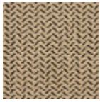
L4043_CERES_ N3002_N3004 _VERSO