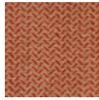
L4043_CERES_ C520_C513_VE RSO