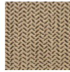
L4043_CERES_ N3002_N3004 _VERSO