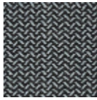
L4043_CERES_ B45_B54_VER SO