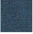
L4043_CERES_ N3161_C533_VE RSO