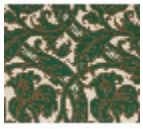
L4065_RICHEL IEU_B22_B46_ FE