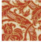
L4065_RICHEL IEU_N3175_N31 38_FE