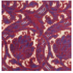
L4065_RICHEL IEU_C528_C519 _FE