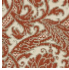
L4065_RICHEL IEU_N3013_N31 32_FE