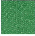
L4077_CHEVR ONS_N3016_C5 40_FE