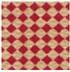
L4092_ARLEQ UIN_B90_N30 04_FE