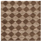
L4092_ARLEQ UIN_C511_N315 7_FE