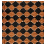
L4092_ARLEQ UIN_N3013_C5 08_FE