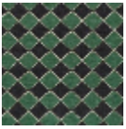
L4092_ARLEQ UIN_B54_B22_ FE