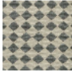
L4092_ARLEQ UIN_N3132_N31 37_FE