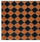
L4092_ARLEQ UIN_N3013_C5 08_FE