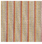
L4123_LES_PE RLES_Canevas _B56_B03_FM