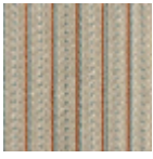
L4123_LES_PE RLES_Canevas _N3016_N3013_ FM