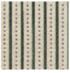
L4123_LES_PE RLES_Canevas _B54_B22_FE