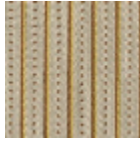
L4123_LES_PE RLES_Canevas _N3021_N3017_ FM