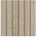
L4123_LES_PE RLES_Canevas _N3016_N3013_ FM