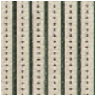
L4123_LES_PE RLES_Canevas _B54_B22_FE