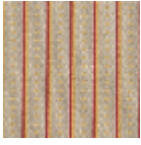
L4123_LES_PE RLES_Canevas _B56_B03_FM