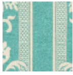
L4129_LUYNES _B73_FE_VERS O