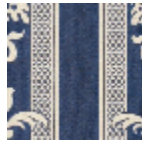
L4129_LUYNES _N3121_FE_VERS SO