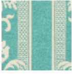
L4129_LUYNES _B73_FE_VERS O