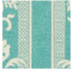
L4129_LUYNES _B73_FE_VERS O