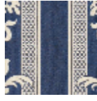
L4129_LUYNES _N3121_FE_VERS SO