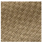
L4152_POINT_ DE_TOURS_B11 3