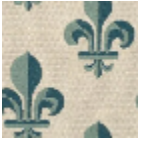
L4168_FLEUR_ DE_LYS_B31_B 65_FE