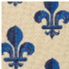
L4168_FLEUR_ DE_LYS_N3011 _N3019_FI