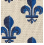
L4168_FLEUR_ DE_LYS_B38_ N3019_FE