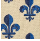
L4168_FLEUR_ DE_LYS_N3011 _N3019_FI