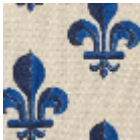
L4168_FLEUR_ DE_LYS_B38_ N3019_FE