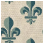
L4168_FLEUR_ DE_LYS_B31_B 65_FE