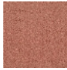
L4172011 Rouge de chine