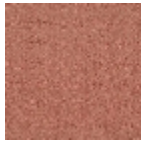
L4172011 Rouge de chine